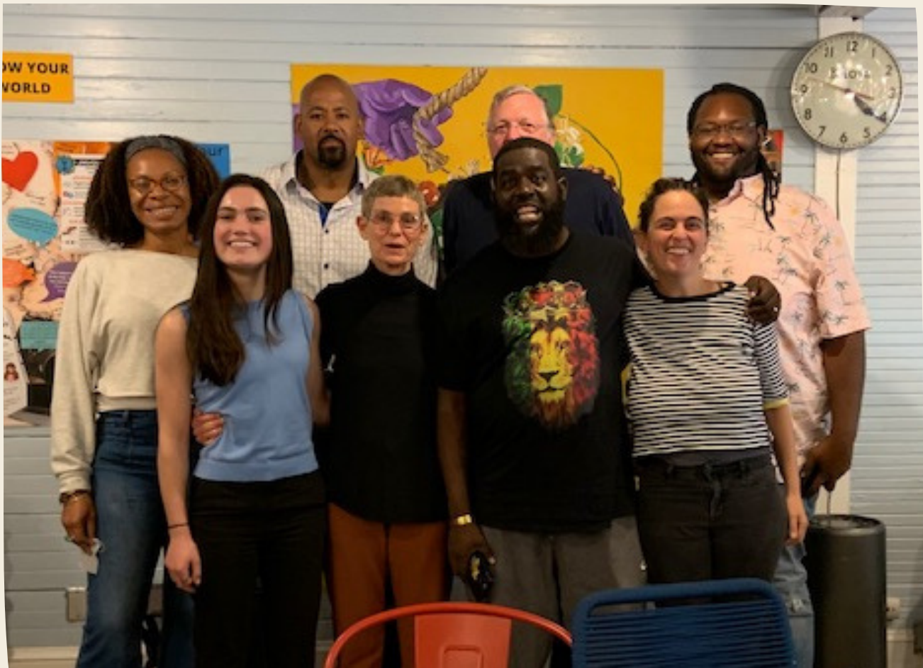
2022 BOARD STRATEGIC PLANNING

To support the families of our participant's, acknowledging the inequities that contribute to youth being impacted by substance use, mental health, and justice involvement.